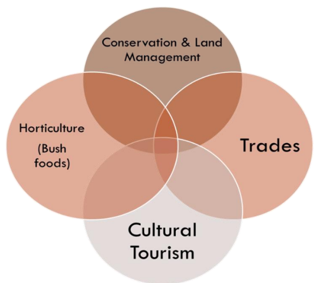
Key Training and Job Creation Focus Areas for the Training and Cultural Hub

Following the December 2016 community workshop, the Consultant and representatives from Badgebup Aboriginal Corporation followed through with meetings and conversations with the Aboriginal Corporations, key leaders, government and community organisations on the agreed priorities of the business plan. The priority program strategies as outlined below will form the next implementation phase of the Badgebup Training and Cultural Hub.